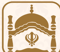
Sohana Gurdwara 2 kms