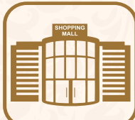
Elante Mall 7 Kms