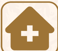
Fortis Hospital 3 kms