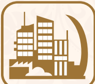
Upcoming Commercial Hub, Sec 87, Mohali 1 Km

Sector 86, Near Airport Road, Mohali www.mohaliroyaltowers.com