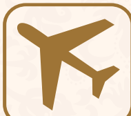
International Airport Mohali 7.5 kms