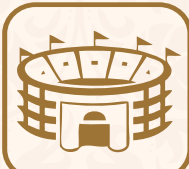
Cricket Stadium Mohali 4 kms