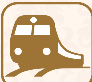
Railway Station Mohali 4Kms