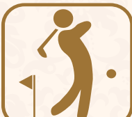
Golf Range Mohali 6 kms