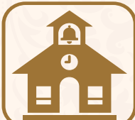
Amity School Mohali 1.5 kms