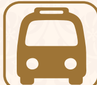
Bus Terminal 3 kms